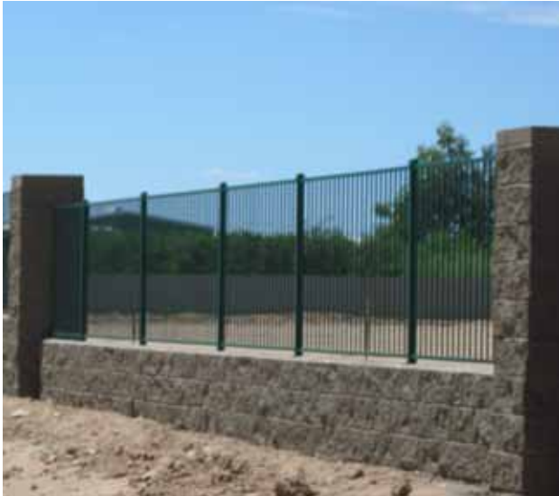
DR Horton Homes "Country Place" 4" Proto-III™ View Wall Phoenix, AZ