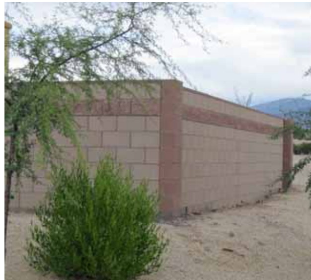
Mesquite Homes "The Mesquites at Pantano" 6" Proto-III™ Theme Wall Tucson, AZ