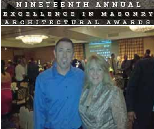
"Royce Masonry was proud to support this event as a Bronze Trowel Sponsor."