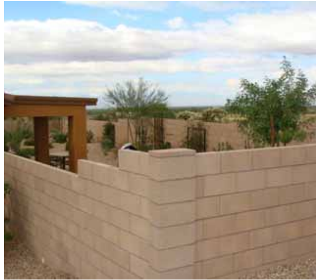
KB Home "Sycamore Vista" 4" Proto-III™ Interior Fence Tucson, AZ