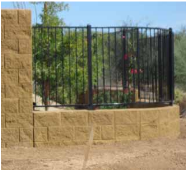
Meritage Homes "Mirabel Village" 6" Proto-III™ View Wall Scottsdale, AZ