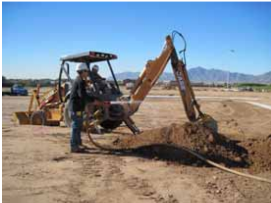
"Royce has invested in new employees and purchased additional vehicles and equipment."